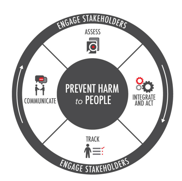
Figure 1: Human rights due diligence

1. Assess : Identify actual and potential impacts on people that might happen as a result of business activities or